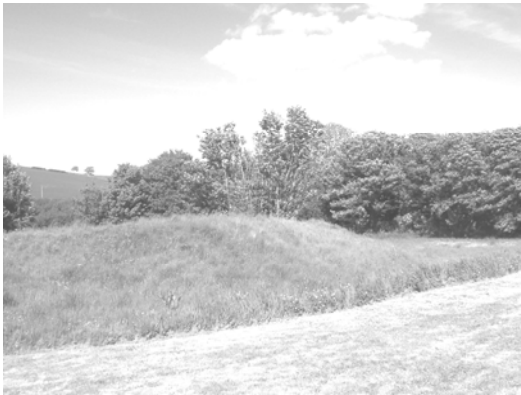
Yr Hen Gastell as it is today!

'Tucked away behind these trees are the remains of a 12 th Century castle. The grassy ridges and hollows mark the defensive banks and ditches which surrounded the timber castle. Wander around this